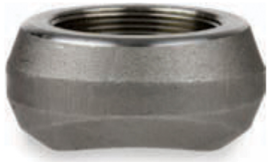
Fig. 43T03 – Threaded Outlet